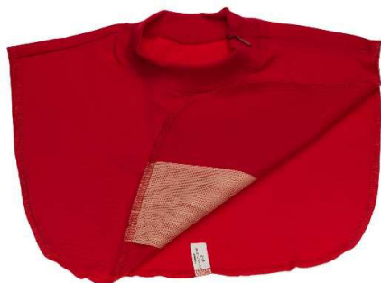
Clothing round neck T-shirt w zip lock