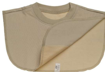
Clothing round neck T-shirt form